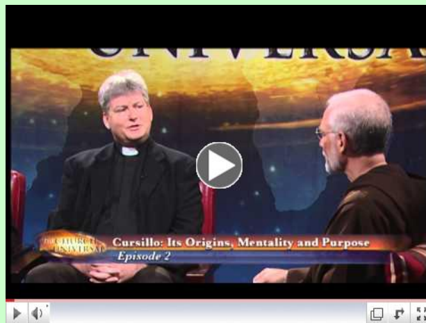
What is a Cursillo?

There is no substitute for the personal witness from one of our Parishioners but here is a wonderful explanation of what Cursillo is from the National Committee.