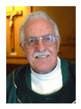
SAINT JOHN'S MASS ASSISTANT FOR 30 YEARS