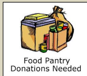
Food Pantry Donations Needed

SAINT VINCENT dePAUL FOOD DRIVE IS SCHEDULED FOR SEPTEMBER 21 ST & 22 ND .