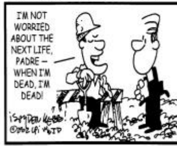
32ND SUNDAY IN ORDINARY TIME

We thank You for our veterans, past and present. Through the efforts of these individuals, help us continue to promote justice in all nations. Amen