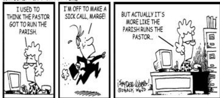
25th SUNDAY IN ORDINARY TIME

PS. We send the rosaries all over the world as well as to our churches and nursing homes etc..