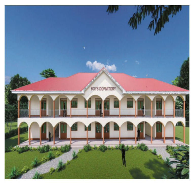
This is the Boy's Dream Dormitory for St. Benedict's High School, located in Kasambya, Mubende District, Uganda. This dormitory will house 200 boys offering them a safe place in which to earn an education, faith, and the ability to become responsible adults.

The total project cost is estimated at $195,074 (USD). Please be as generous as you can to help make this dream a reality.