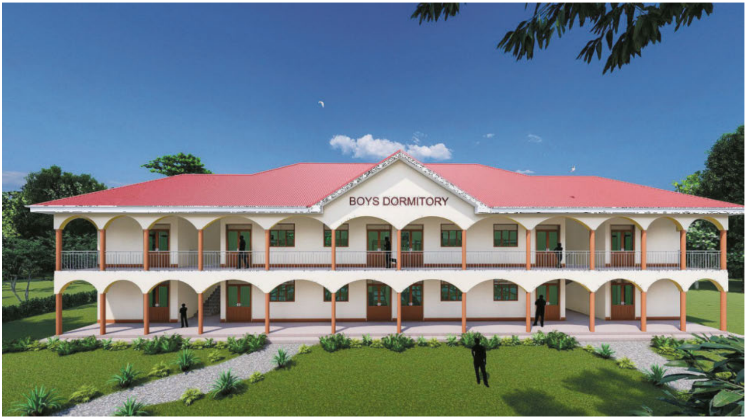
This is the Boy's Dream Dormitory for St. Benedict's High School, located in Kasambya, Mubende District, Uganda. This dormitory will house 200 boys offering them a safe place in which to earn an education, faith, and the ability to become responsible adults. The total project cost is estimated at $195,074 (USD). Please be as generous as you can to help make this dream a reality.