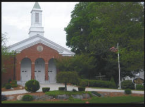
St. John the Evangelist