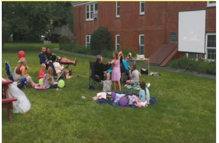
Fun was had by all at the showing of Encanto on August 5th

Please sign up here if you plan on helping: https://forms.gle/GVyBxJg2uqHysShM8 . This link will also be posted on the parish websites.