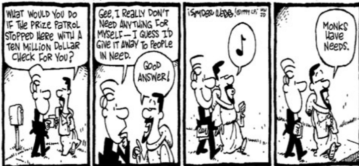
17 th SUNDAY IN ORDINARY TIME