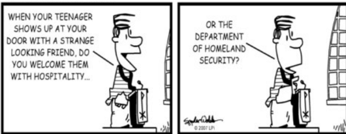
16TH SUNDAY IN ORDINARY TIME

Please give of your time and talents to help our parishes!