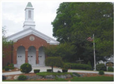
St. John the Evangelist