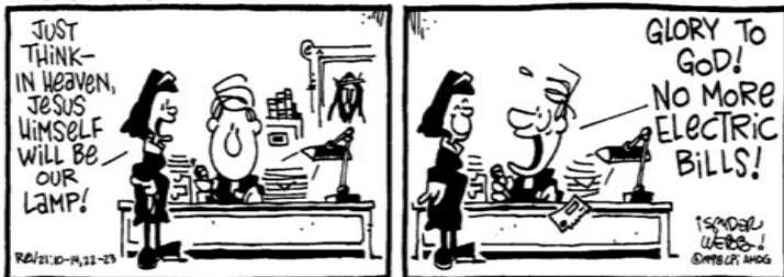
6th SUNDAY OF EASTER

St. Ann's 508-586-4880 or St. John's 508-378-4207