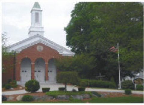
St. John the Evangelist