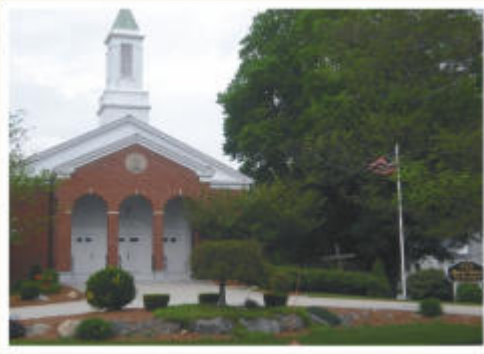
St. John the Evangelist