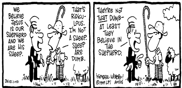
4 th SUNDAY OF EASTER