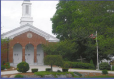
Saint John 's