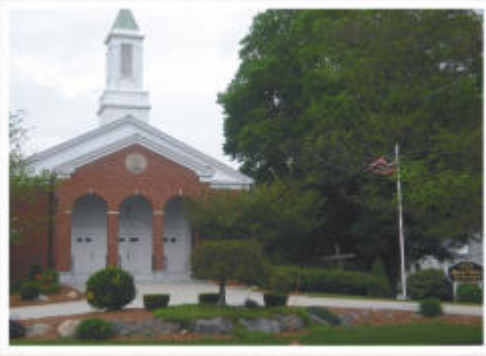
St. John the Evangelist