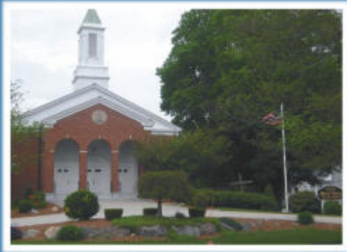
St. John the Evangelist