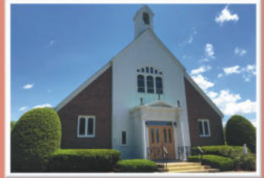
St. John the Evangelist