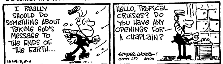
2 nd SUNDAY IN ORDINARY TIME

White tuna, cereal, and soups are always needed.