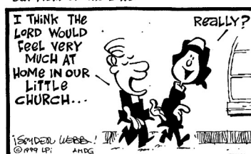
BAPTISM OF THE LORD